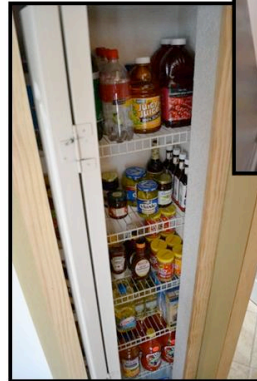
Jars and bottles