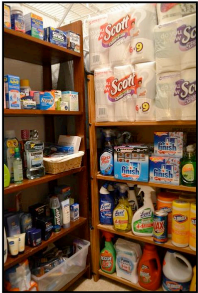
Drugstore, Toiletries, and Cleaning Supplies